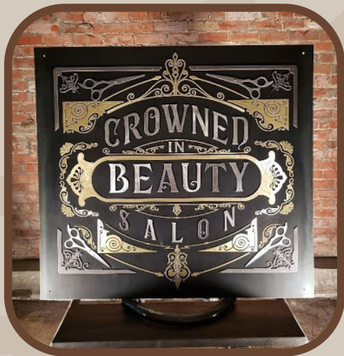
CUSTOM BRASS, STAINLESS & STEEL WATERJET SIGN