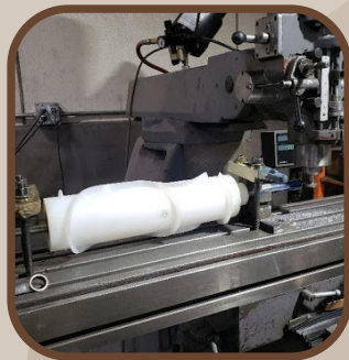
MACHINE WORK & EXOTIC MATERIALS