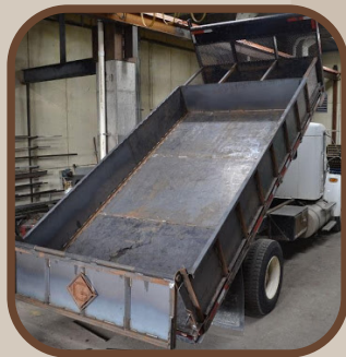
CUSTOM BUILT DUMP BED & HEAVY EQUIPMENT REPAIR