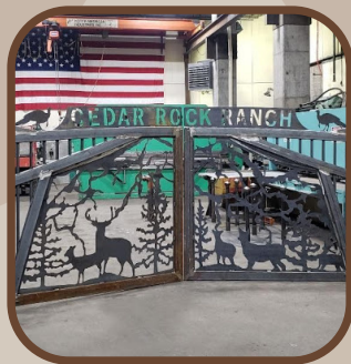
CUSTOM GATES AND FENCING